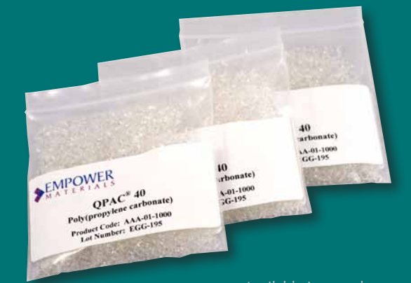
Available in granulates, pellets, aqueous dispersion and solutions